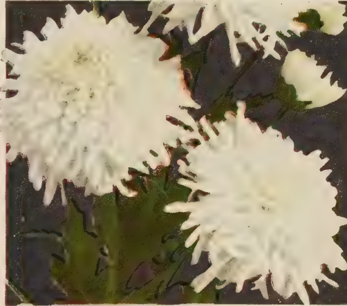
WINTERSET. 60c each; 3 for $1.50